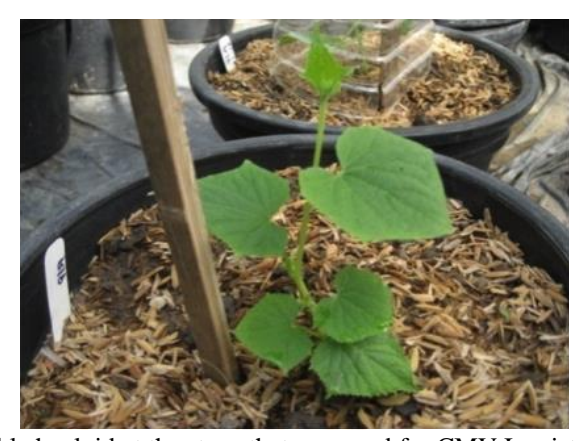
Fig. 1. Double haploid at the stage that was used for CMV I resistant screening

Plantlets of double haploid (DH) lines plantlets which obtained from ovaries cultured were multiplied in the laboratory after that were transplanted and grown in the 25 cm. pots under the insect exclusion greenhouse. Nine clones of DH at the 4-5 leaf stage were inoculated with virulent CMV by rubbing the inoculums) 1:5 dilution leaf material: 0.1 M phosphate buffer pH 7( on carborundum dusted leaves (Figure 1). After 15 min, the inoculated leaves were rinsed with tap water and kept under the insect exclusion greenhouse. Inoculated plants were monitored for 4 weeks after inoculation: symptoms and disease severity were recorded and plants were tested for CMV using DAS-ELISA.